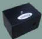
Bump Integrators - Roughness (e.g. IRI)