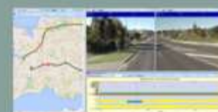
DataView Office Post-Processing

Laser Profilometers - High Accuracy Roughness (IRI), - Longitudinal Profile - Macrottexture (MPD)