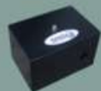
Bump Integrators - Roughness (e.g. IRI)