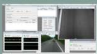
ROMDAS Data Acquisition In Vehicle