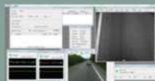
ROMDAS Data Acquisition In Vehicle