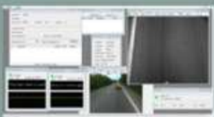
ROMDAS Data Acquisition In Vehicle

Laser Profilometers - High Accuracy Roughness (IRI), - Longitudinal Profile - Optional: Macrotecture(MPD)