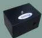
Bump Integrators - Roughness (e.g. IRI)